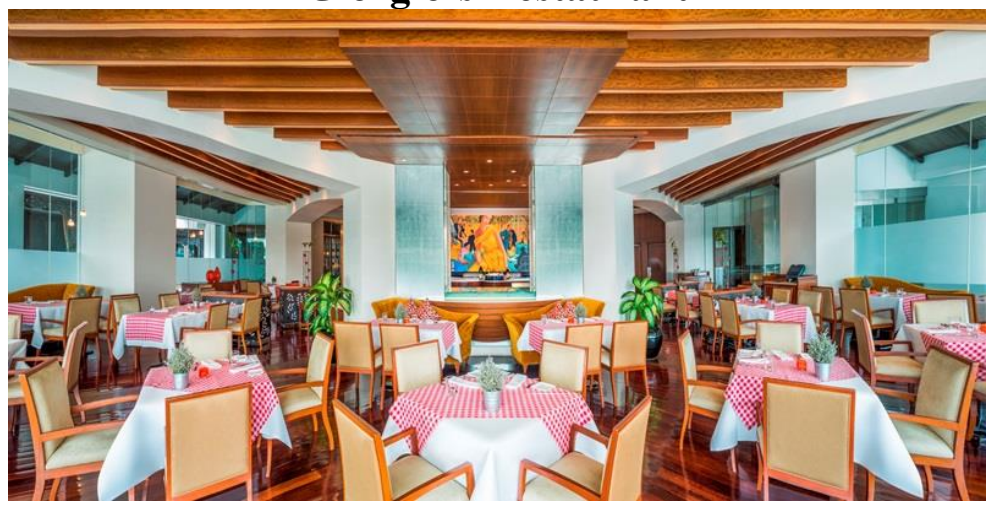
Pomodora, Mozzarella, Frutti Di Mare